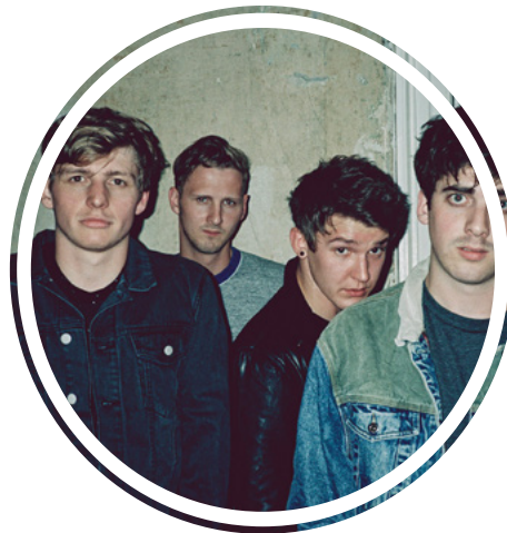
Circa Waves (STORM No. 26)