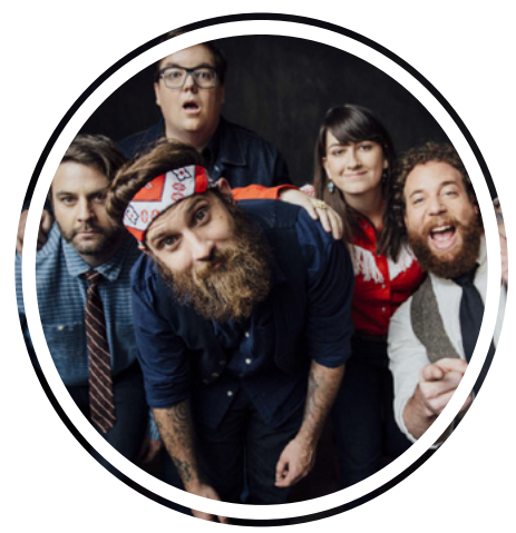
The Strumbellas (STORM No. 35)