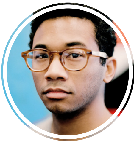
Toro Y Moi (STORM No. 5)