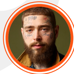
POST MALONE (STORM No. 30)

Singer-songwriter Maggie Rogers is having a festival-filled summer, headlining spots at some of this year's biggest events. From Hinterland to Outside Lands fans are excited to see her live and on the main stage. Catch her on tour across the US, including spots at Lollapalooza and Austin City Limits.