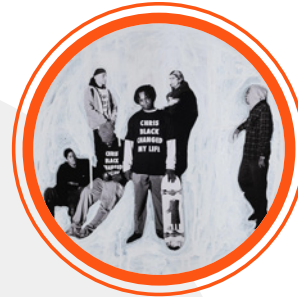
PORTUGAL. THE MAN (STORM No. 13)

STORM Alum Metro Boomin is the talk of the town for the Spider-Man: Across the Spider-Verse soundtrack, helmed by the super-producer himself and featuring a myriad of hip-hop talents. The album debuted on the Billboard 200 albums chart at No. 5 earlier this month. Not only did he curate the successful soundtrack, but he had a brief cameo in the film too. Keep an ear out for his comedic one-liner!