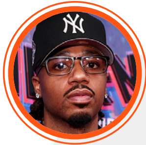
METRO BOOMIN (STORM No. 51)

STORM Alum Metro Boomin is the talk of the town for the Spider-Man: Across the Spider-Verse soundtrack, helmed by the super-producer himself and featuring a myriad of hip-hop talents. The album debuted on the Billboard 200 albums chart at No. 5 earlier this month. Not only did he curate the successful soundtrack, but he had a brief cameo in the film too. Keep an ear out for his comedic one-liner!