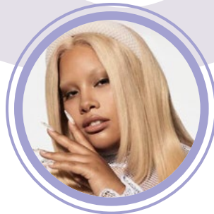
SHYGIRL (STORM No. 78)

The best-selling (and heartbreaking) memoir Crying in H Mart by Michelle Zauner, better known as indie rocker Japanese Breakfast , will be made into a movie under the direction of The White Lotus actor, Will Sharpe. Zauner will write the script based on her memoir, which details her early years in Oregon, her time with her grandmother in Seoul, how she met her husband, and of course, her musical career.