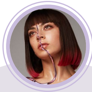
CHARLI XCX (STORM No. 10)

Charli XCX and Jack Antonoff have signed on to write music for the upcoming film Mother Mary . The A24-produced film stars Anne Hathaway as a fictional musician and explores her relationship with Michaela Coel, who plays a fashion designer. XCX and Antonoff will compose original songs for the film presumably for Hathaway's character.