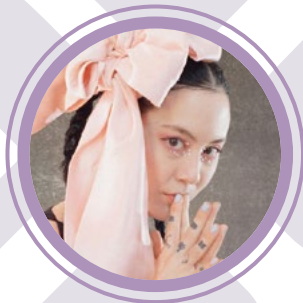
JAPANESE BREAKFAST (STORM No. 62)

Charli XCX and Jack Antonoff have signed on to write music for the upcoming film Mother Mary . The A24-produced film stars Anne Hathaway as a fictional musician and explores her relationship with Michaela Coel, who plays a fashion designer. XCX and Antonoff will compose original songs for the film presumably for Hathaway's character.